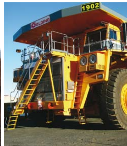
Belraz truck, mining equipment Protection by Penguard Express ZP and Hardtop