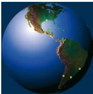
Worldwide service and support