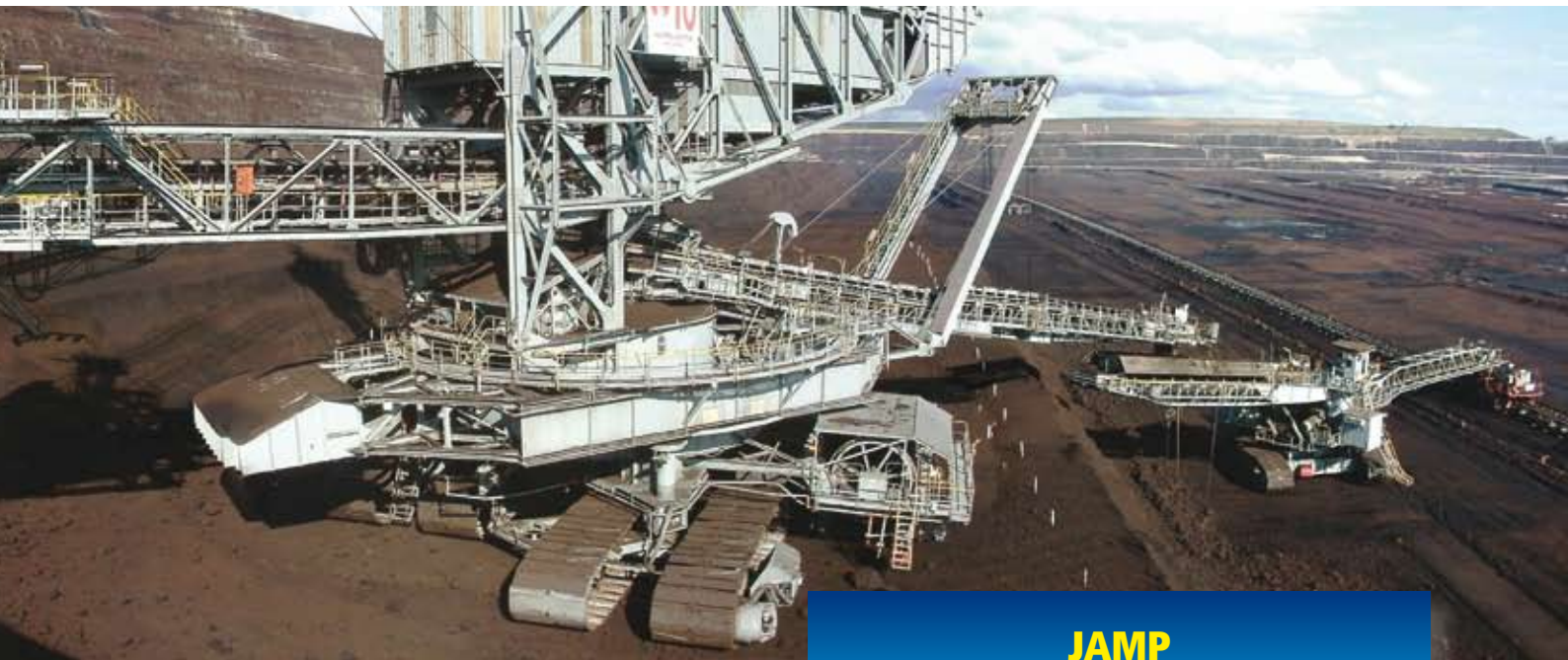
Hazelwood Mine, Australia. Protected by Barrier and Jotamastic 87