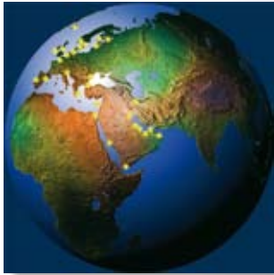
Jotun companies in 67 countries