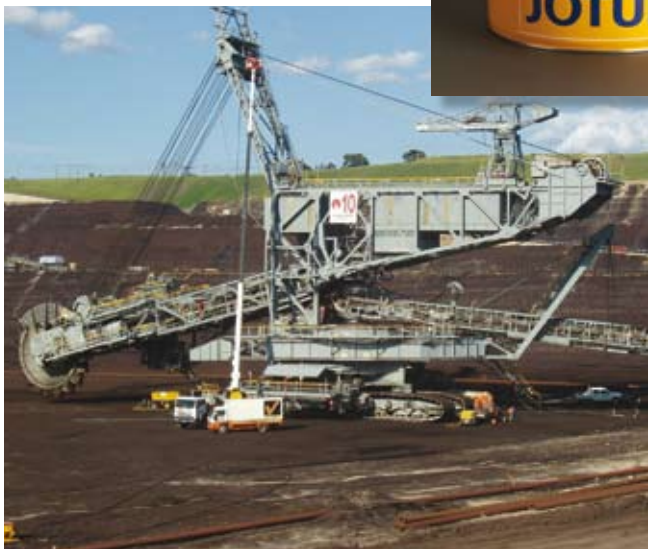
Hazelwood Mine, Australia Protected by Barrier and Jotamastic 87