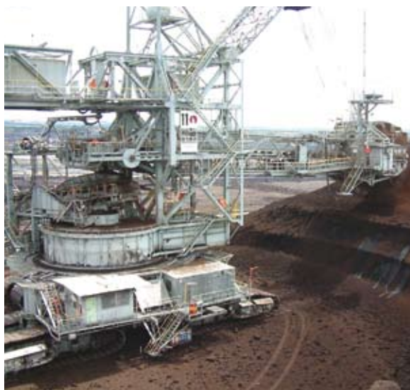
Hazelwood Mine, Australia Protected by Barrier and Jotamastic 87

facilities, contractors, engineering consultants and oil companies. It has proved to increase product knowledge, improve communication and understanding of common problems and their solutions.