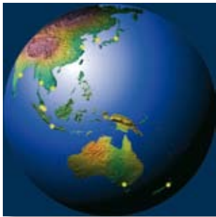
40 production facilities globally