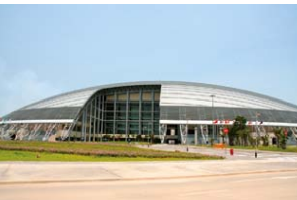
Macau Dome, Macau, China