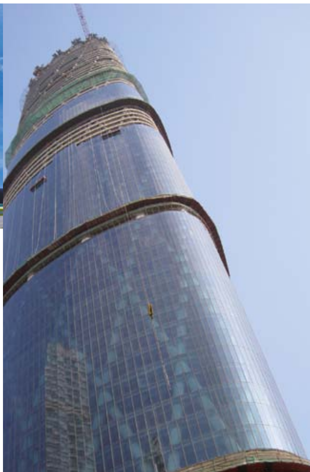
Jotun coating systems protect Guangzhou West Tower, Guangzhou, China