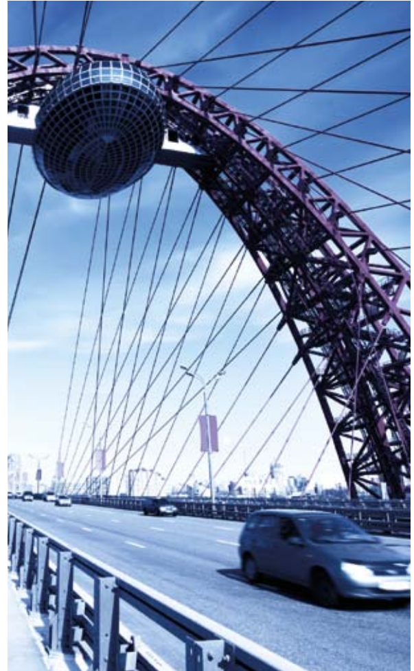
Zhivopisny Bridge, Moscow, Russia