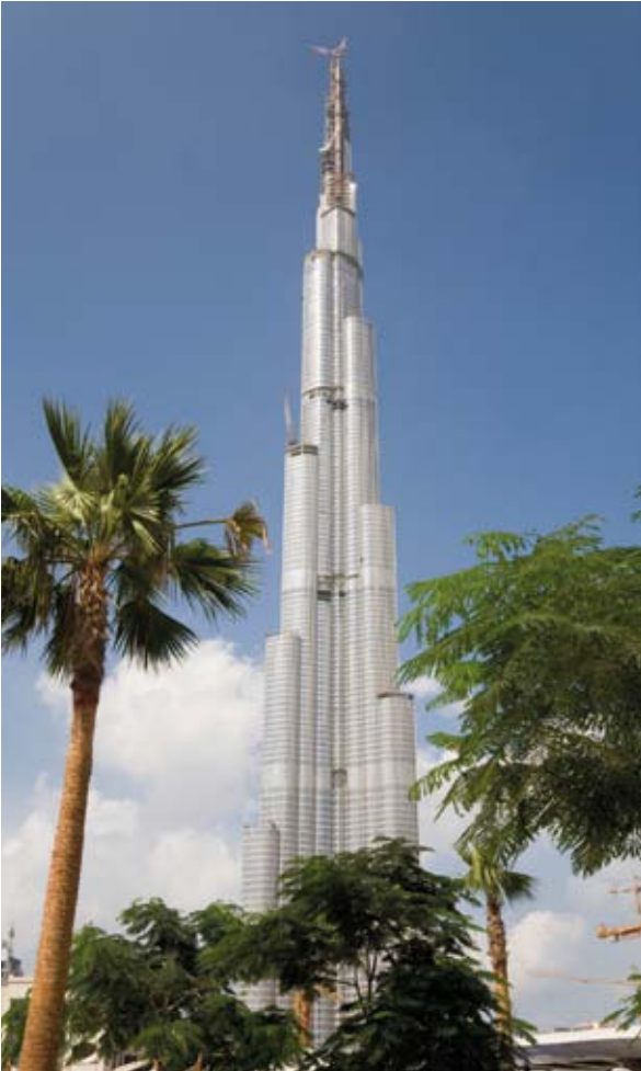
Burj Dubai, Dubai, U.A.E.