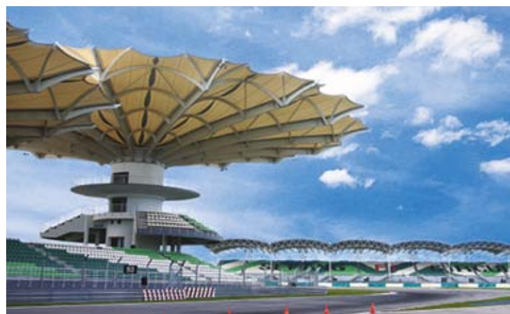
Jotun coating systems protect the Malaysia Kuala Sepang F1 Circuit, Malaysia

Jotun's recognition of its responsibility for the protection of the environment, customers and employees contributes towards the raising of standards in the industry worldwide.