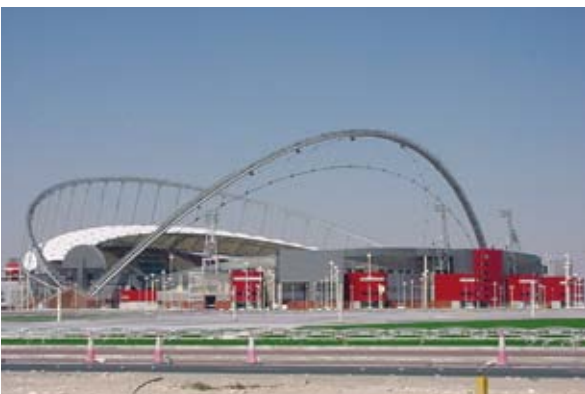
Khalifa Stadium, Qatar