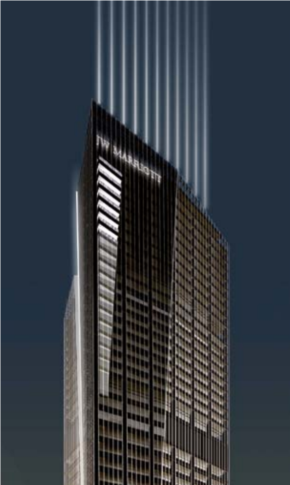
Esentai Tower, Almaty, Kazakhstan