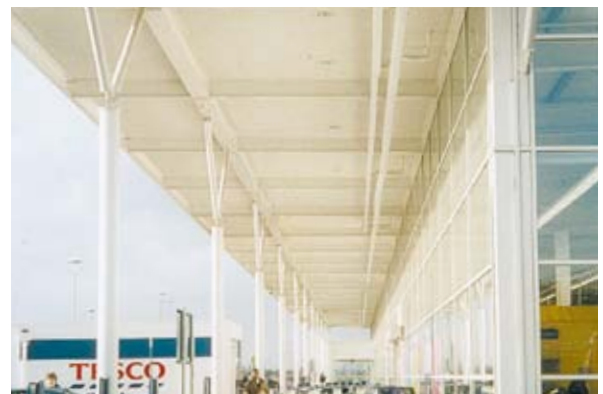
Tesco Buildings, UK