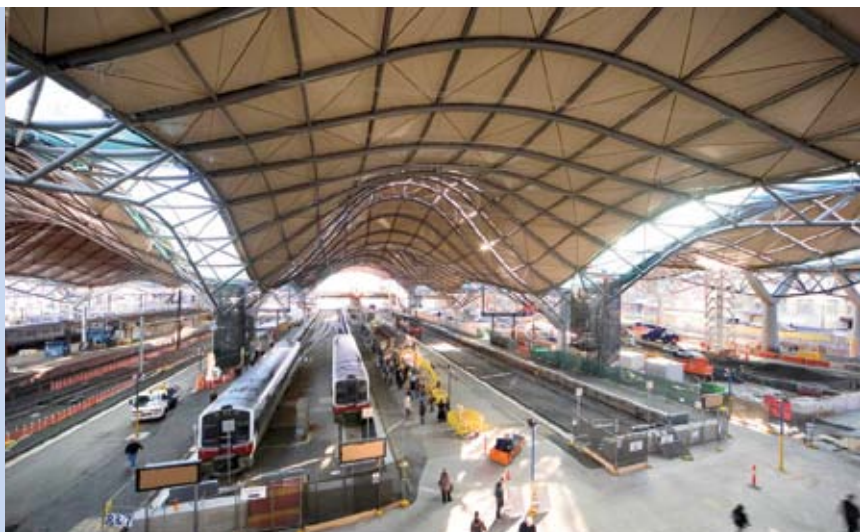
Jotun coating systems protect the US$600m Southern Cross Railway Station development in Melbourne, Australia.