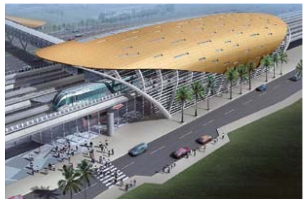
Dubai Metro, Dubai, U.A.E.