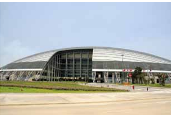
Macau Dome, Macau, China