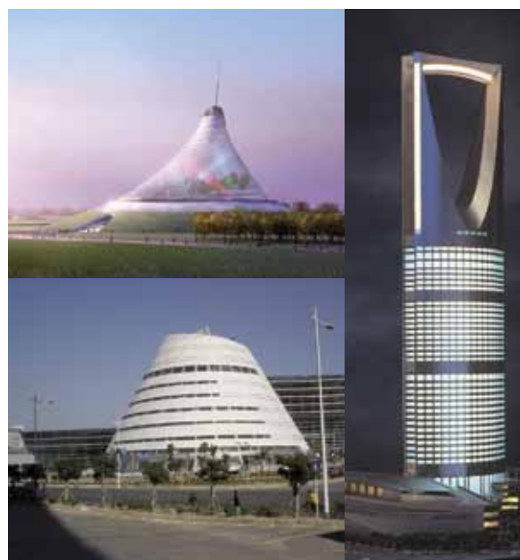
Protected with Jotun systems: Top: Khan Shatry, Astana, Kazakhstan Left: Kingdom Trade Centre, Saudi Arabia Bottom: Dongguan Opera House, China