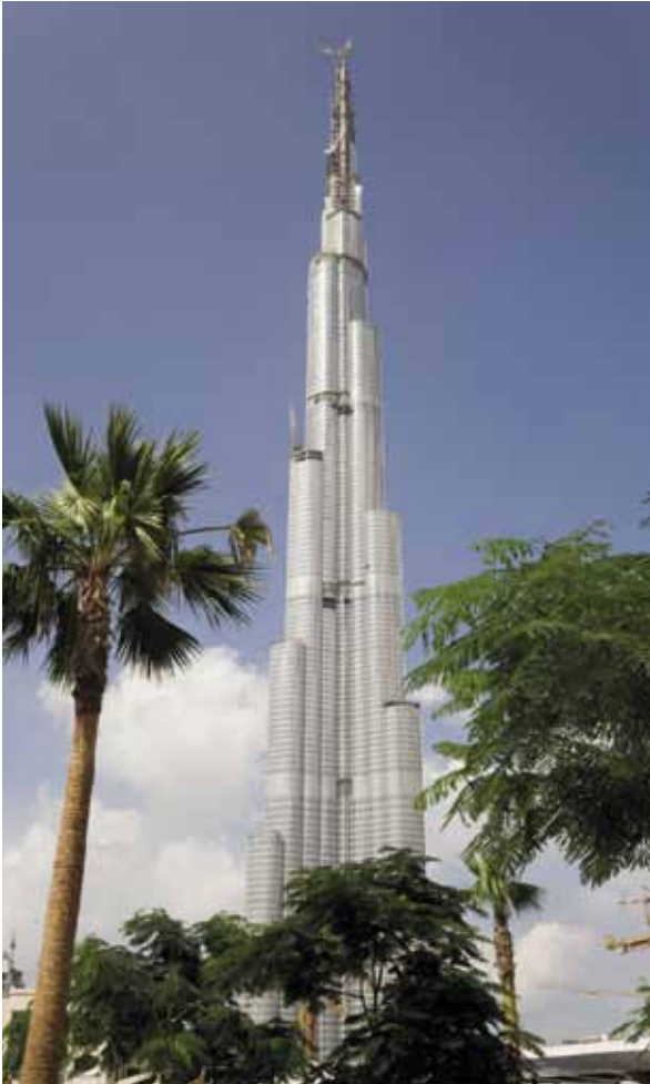
Burj Dubai, Dubai, U.A.E.