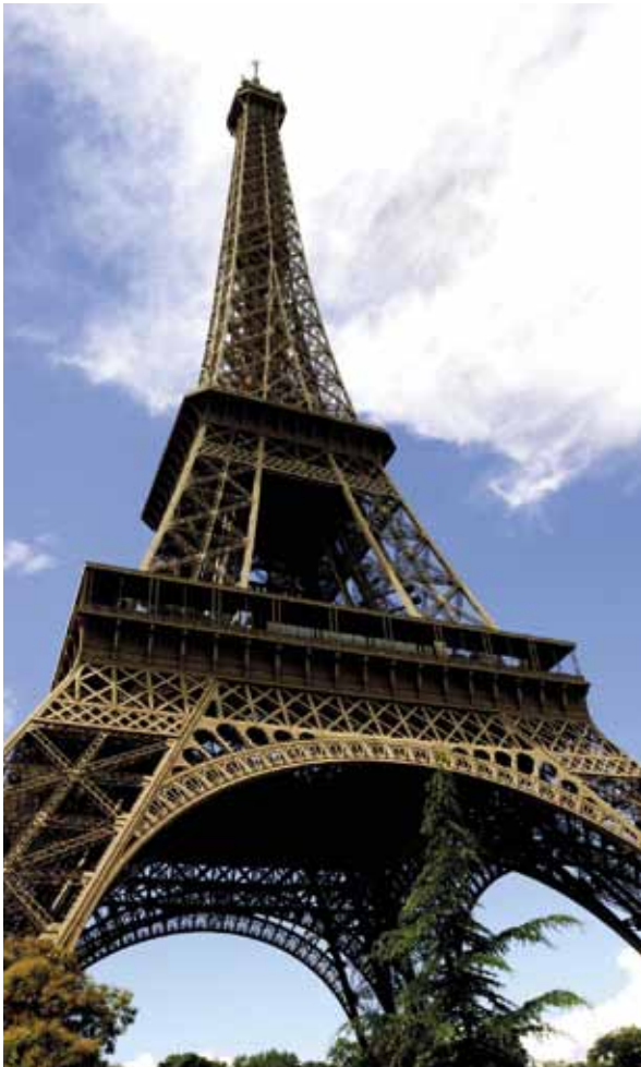
Eiffel Tower, Paris, France