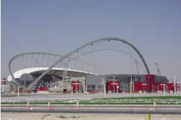
Khalifa Stadium, Qatar