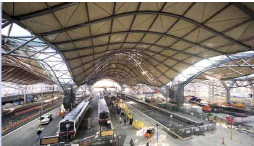
Jotun coating systems protect the US$600m Southern Cross Railway Station development in Melbourne, Australia.