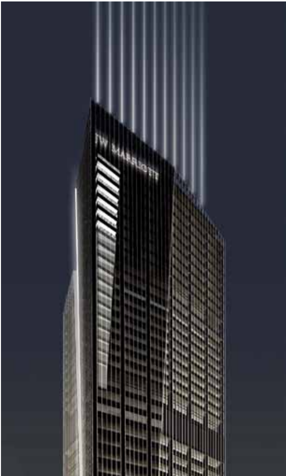
Esentai Tower, Almaty, Kazakhstan