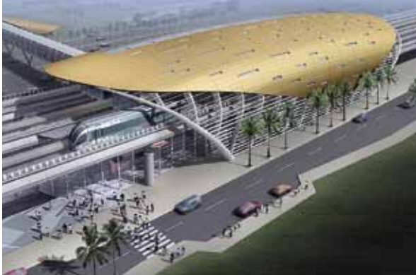
Dubai Metro, Dubai, U.A.E.