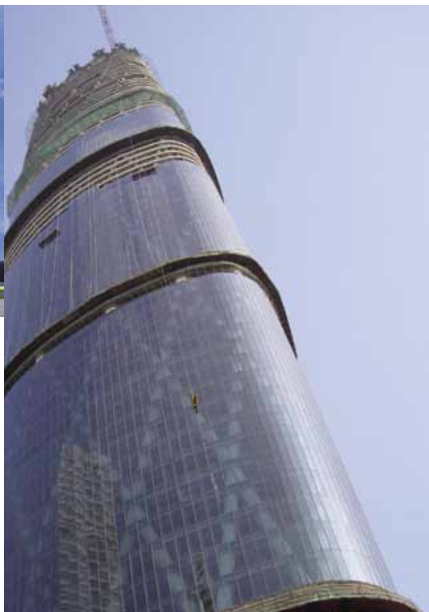
Jotun coating systems protect Guangzhou West Tower, Guangzhou, China