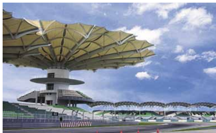
Jotun coating systems protect the Malaysia Klia Sepang F1 Circuit, Malaysia

Jotun's recognition of its responsibility for the protection of the environment, customers and employees contributes towards the raising of standards in the industry worldwide.