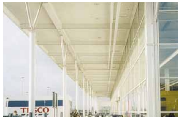
Tesco Buildings, UK